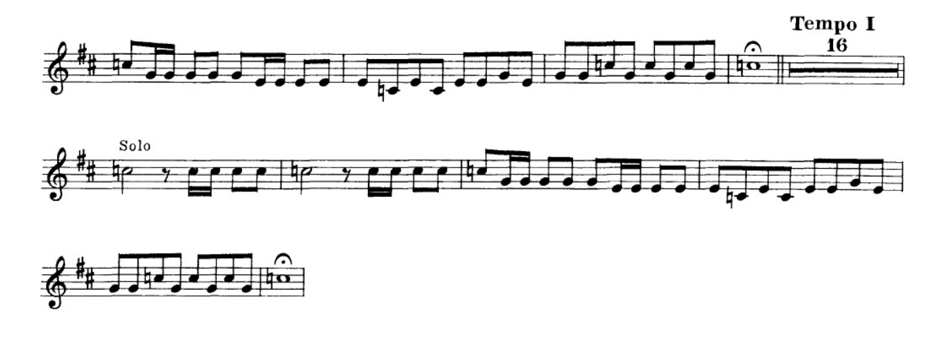
Bizet - Carmen: Prelude to Act I mm.3-28