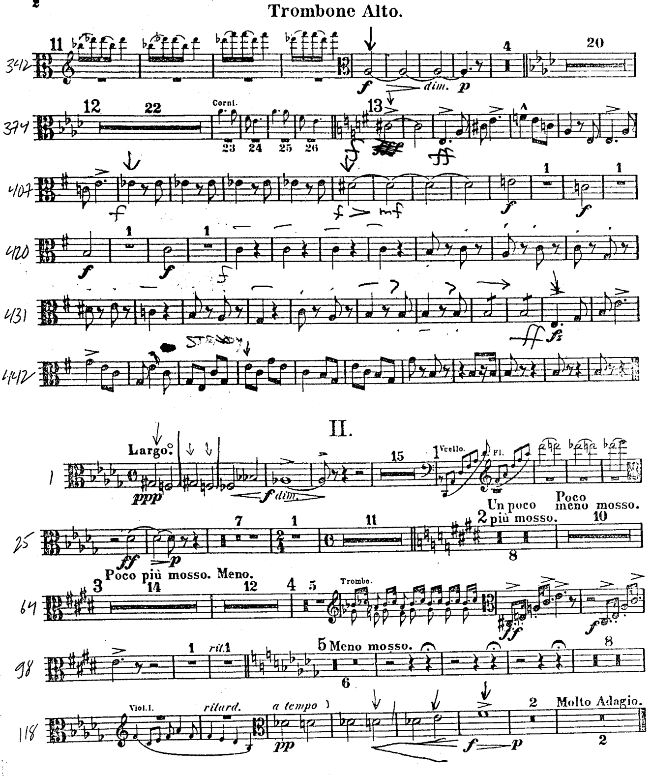
III. Scherzo tacet.